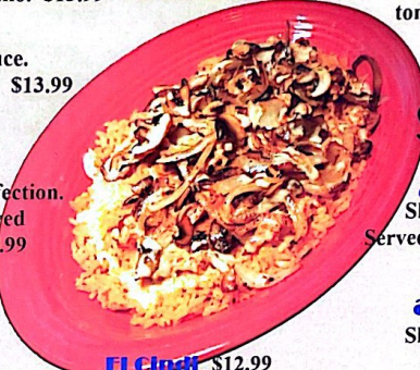
El Chich $12.99

Bit of rice grille chicken Onions and Mushroom on top w/Cheese dip on top