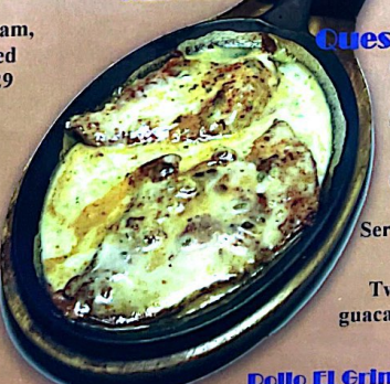
Pollo El Gringo