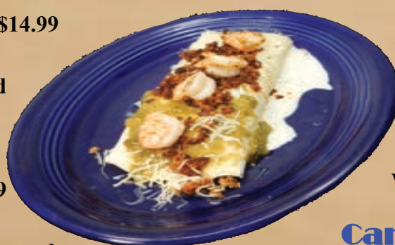
10" Vaqueros Burrito

Bed of rice grille chicken Onions and Mushroom on top w/Cheese dip on top