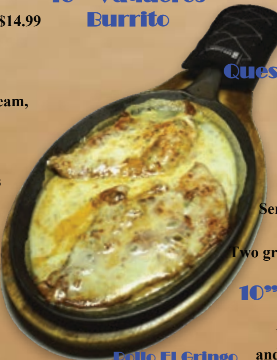
Pollo El Gringo